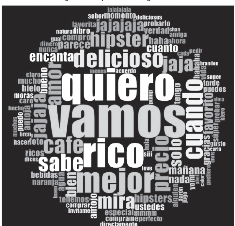
Figure 1. Frequent word 'tags' cloud

The previous typology contains some words taken as key words for our codification, and it was verified with the result of the data generated by the analysis software of qualitative data NVivo, emphasizing the most frequent words expressed in the consumer feedback. It was observed that many of the expressions found in the aforementioned program correspond to the words included in our typology.